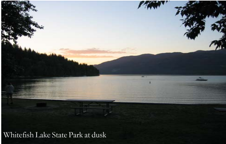
Whitefish Lake State Park at dusk

Open: January 1 - December 31 Limited Camping: October 1 - April 30