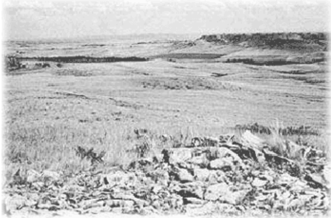
Battle of the Rosebud Site in Big Horn County, Montana.

Given the number of combatants, the Battle of the Rosebud was one of the largest confrontations waged in the Indian Wars.